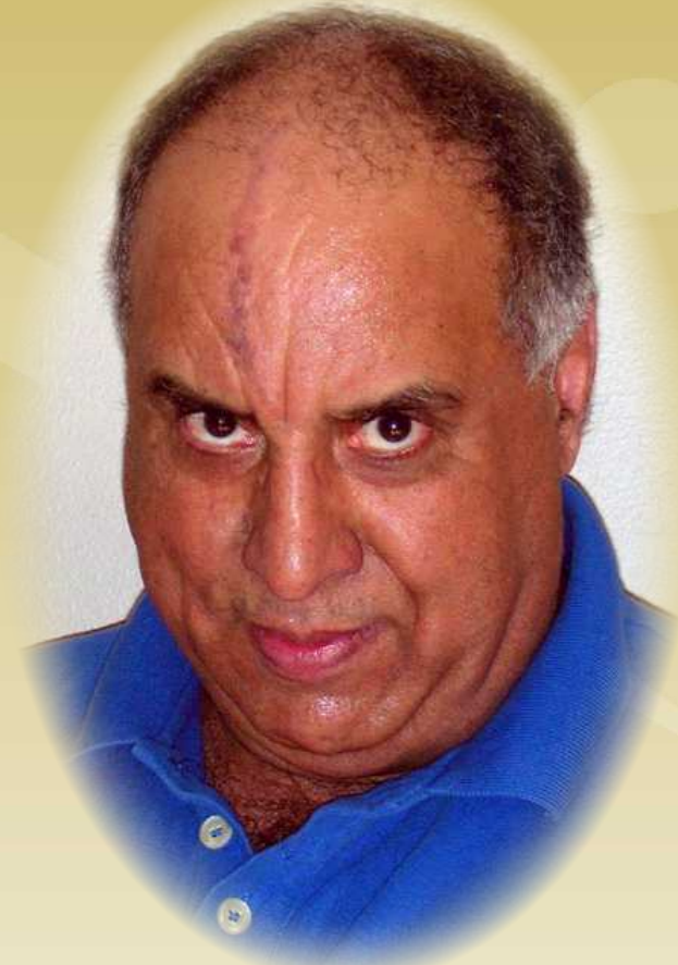
SHARIF KHAN 12 time North American Champion

THESE FIVE SPECIAL PEOPLE ARE THE FIRST TO BE INDUCTED INTO THE ONTARIO SQUASH HALL OF FAME